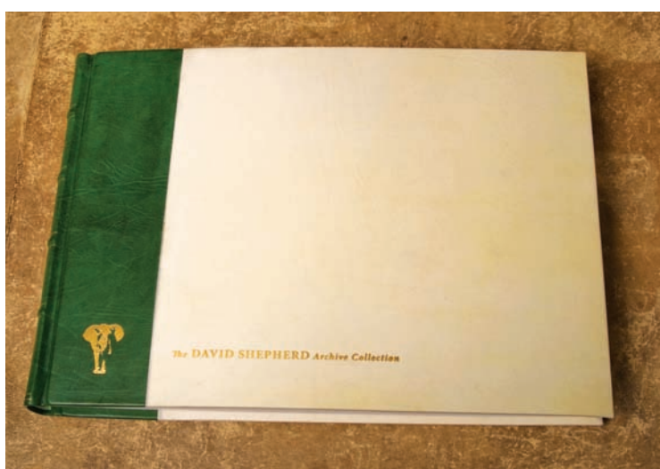
A finished sample in English Vellum, leather and 22ct gold