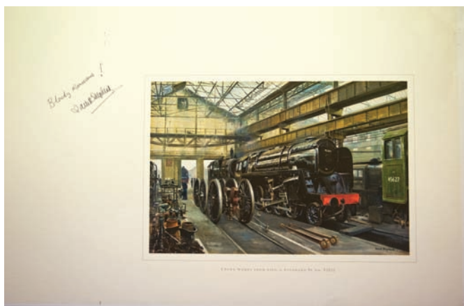
A proof sheet with David's opinion !